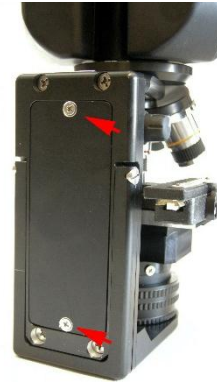
Figure 2: Battery housing cover

With a small Phillips screwdriver carefully open the battery housing cover at the back of the microscope (Fig. 2, marked by arrows) and place three AAA batteries according to the directions drawn in the housing. Rechargeable batteries can be used, but the microscope is not equipped for charging, which should be made in a normal charger. Fully charged batteries will suffice for approx. 15-22 hours of work depending on brand, light volume and climatic conditions.