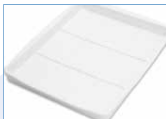
Drying agent tray