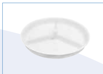
Drying agent tray