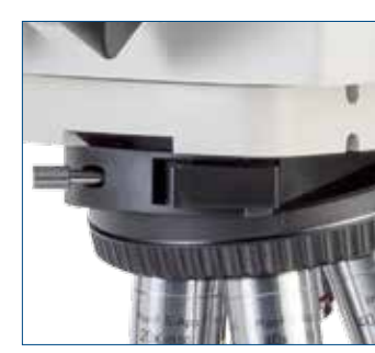
For slider with 1\lambda retardation plate for observation of monosodium crystal deposition (gout) and for DIC slot (DIC ready)