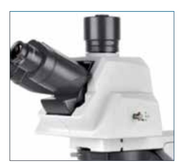
Optional: ergonomic tilting head

· Revolving sextuple reversed nosepiece on ball-bearings