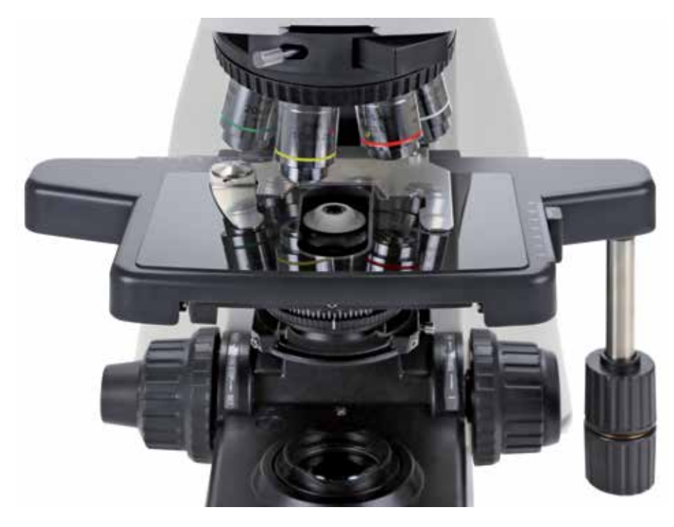
Optional: mechanical stage with scratch-resistant Sapphire glass

The Delphi-X Observer's design provides more comfort and convenience for professional microscopists. The double fine and coarse focus control knobs can be switched from left to right as per user preference. The anti-slip coated adjustment knobs provide maximum user comfort during displacement of the sample. Switching of the neutral density filters, setting the Köhler diaphragm and adjusting light intensity can all be controlled without lifting your hands to prevent fatigue