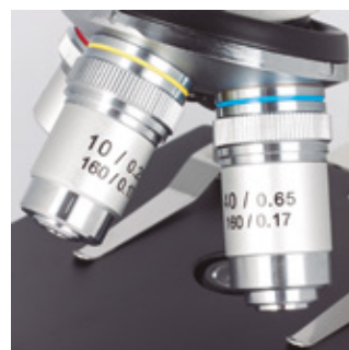
DIN Achromatic objectives