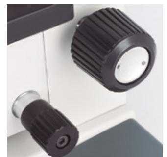
Coarse and fine focusing system