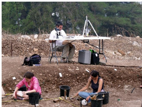
Figure 3: The operation of an on-site petrographic laboratory at the Pre-Pottery Neolithic B (about 9000 years old) site of Kfar Hahores, near Nazareth, Israel, in 2010. The laboratory includes a microscope, equipment for the preparation of quick petrographic thin sections, and portable XRF (on the tripod) for ad-hoc elemental analysis

Hereby, the micromorphologist acquires important data regarding the principal features of the site—this in turn making sampling for further laboratory studies much more efficient. The fact that numerous micromorphological features can be understood and interpreted during the season also means that the excavation strategy can be influenced or even dictated.