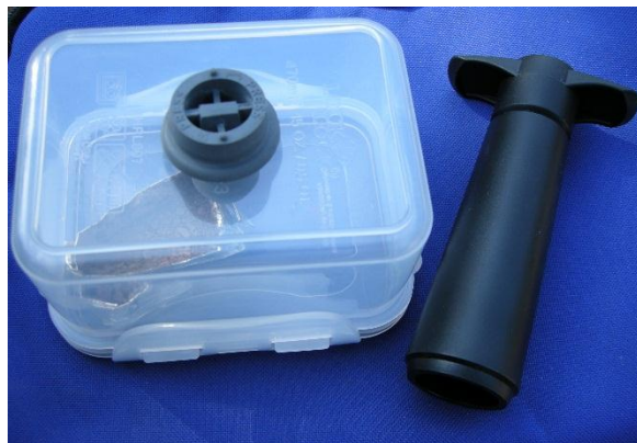
Figure 11: Improved vacuum desiccator for sample impregnation made of a microwave lunch box and a wine-stopper pump. Notice the sample in the aluminum foil mold inside the box

then being drawn over the cover and closed. Deflating the air with the pump creates enough vacuum to allow efficient impregnation for small and medium samples. Nearly complete impregnation can be seen in the desiccator when numerous tiny bubbles appear on the surface—a stage nicknamed “boiling” by micromorphologists.