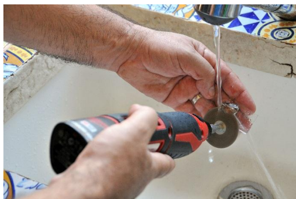
Figure 13: Cutting a sample from the carrying glass using a rotary tool with a 2" diamond disk saw/lap wheel under running water

The first slicing is made by holding the rotary tool with one hand and the sample with the other under slowly running water or slightly immersed in a bucket or tub ( Figure 13 ). The motor is operated at a low RPM to ensure that the disk revolves slowly and to avoid water splashing, the sample being brought to the disk and cut steadily. Although diamond disk saws are not sharp or denticulated, the slow rotation also precluding risk of injury, protective glasses should be worn to avoid damage to the eyes caused by shooting particles. It takes some time to find the best position to achieve a clean cut and direct the splash of water away from the operator. A tub, tap, and thin, steady flow of water are the optimal requirements. If the sample is small, it can first be ground on the lapping side of the wheel. This ensuring that the coarse sawing ridges are removed and the surface is generally flat. Further grinding in the grinding tub is usually required, however.