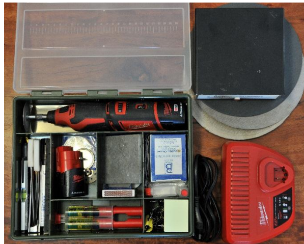
Figure 9: The portable thin-section laboratory in packed position (the scale is indicated by the cm ruler on the organizer cover). The three unpacked items on the right side are a battery charger for the rotary tool, mini hotplate, and three metallographic grinding pads.

In many cases, this stage is unnecessary, most types of igneous and sedimentary rocks, mortars, and ceramics not crumbling or disaggregating when cut or polished. Surface impregnation (see stage 2 below) can frequently be conducted quickly if the sample surface loses grains in polishing. If impregnation is redundant, the process of thin-section preparation will start at stage 2 (below).