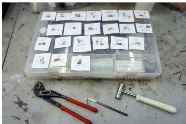
Figure 10: Samples of archaeological ceramics waiting to be thin sectioned by the portable laboratory in an Israel Antiquities Authority storage facility near Jerusalem

Temporary containers for the sample impregnation can be created in many ways. The size of the container should not greatly exceed the sample in order to avoid wasting cement and lengthening the time required for setting. For small samples, simple kitchen aluminum foil forms a perfect and always-available solution. Several squares or circles of the foil are cut, placed together to form a multi-layered wall to avoid leaks, and folded into a basin-shape slightly larger than the sample. Approximately half of the container is filled with the impregnation medium, the sample gradually being soaked into it and absorbing the cement. The container with the sample and cement may be placed in an improvised vacuum desiccator ( Figure 11 ) to ensure complete impregnation. It is then exposed to controlled heating (see below) to accelerate curing. Containers can be also made from milk boxes, aluminum muffin or cupcake foil cups, or polyethylene cups—any bowl-shaped container capable of holding epoxy glue.