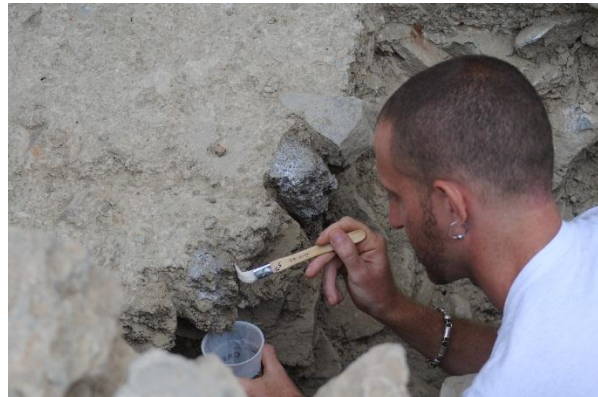
Figure 1: Sediment sample blocks are prepared for removal at the archaeological site of Koumasa, Crete, 2013. The blocks are coated with PVA mixed with water to avoid surface crumbling during removal and before impregnation.

Archaeological micromorphology is a soil analysis technique that contributes to our understanding of site-formation processes. Combining microscopic and macroscopic observations of physical properties of sediments with the aim of evaluating the depositional origin and integrity of archaeological strata, micromorphological samples allow the contextual analysis of archaeological materials, micro-artifacts, and waste products, microscopic faunal and plant remains being observed in situ .