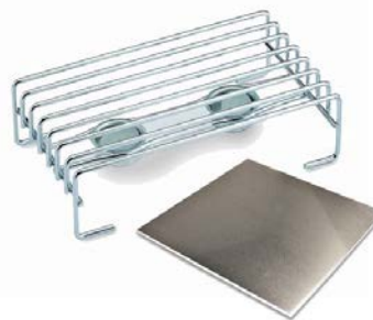
Figure 16: Improvised wireless mini hotplate made of rectangular wire table food warmer and an aluminum plate.

If a 220V/110V mains is unavailable, a simple hotplate can be easily improvised in the manner illustrated in Figure 16. Here I used a candle-heated rectangular food warmer, on top of which I placed an aluminum plate. Heating can be moderated by several layers of tissue paper put on top of the plate.