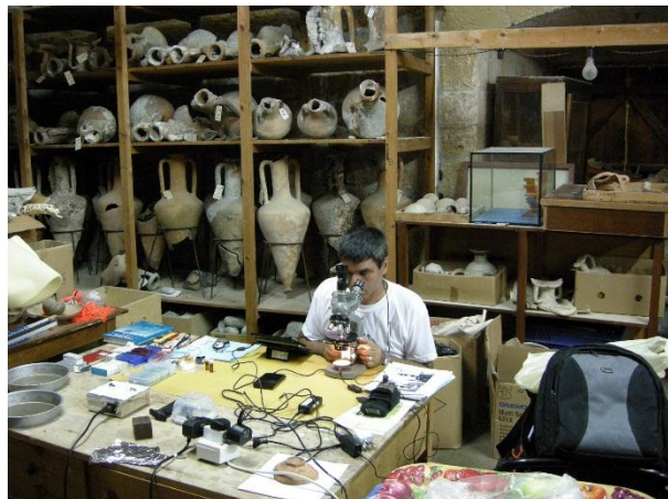
Figure 2: On site petrographic examination of pottery vessels from the fifth-century BC Kyrenia shipwreck at the Ship Museum in Kyrenia (Northern Cyprus). Some of the amphorae from the ship are seen behind the microscopist. The portable thin section laboratory was brought in the backpack seen at the lower right corner, enabled the preparation and examination of approximately 100 thin sections within a few days

micromorphologist is also prevented from returning to a feature that proves interesting under the microscope, because it has been excavated and completely removed before the laboratory study and the next field season.