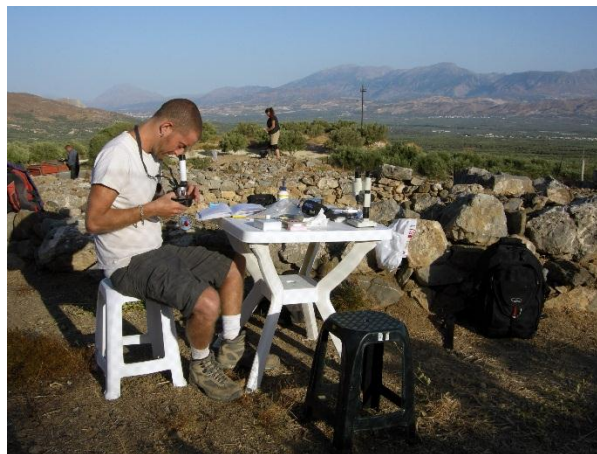
Figure 4: Operation of on-site micromorphological laboratory for the preliminary examination of small sediment samples at the Minoan site of Koumasa, Crete, summer 2012. The micromorphologist is using an early version of the Goren portable petrographic microscope to examine a sample

situations demand the production of thin sections completely in the wild, the scientist can normally reach a camp, house, hotel room, or cabin at some stage. While not absolutely imperative, running water and mains electric power make things easier and reduce manual labor.