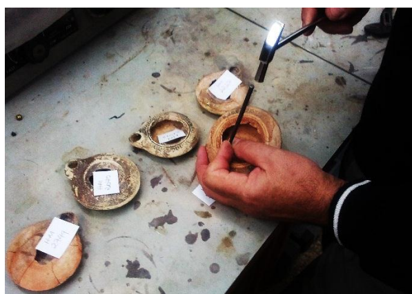
Figure 8: Sampling a series of Roman oil lamps from Apolonia-Arsuf, Israel using a small chisel and jeweler's hammer to remove a small chip from the inner part of the vessel

Prior to slicing and grinding, crumbly materials are impregnated with thin-section epoxy. Large blocks are treated similarly to micromorphological samples (see above), smaller samples being placed on several layers of aluminum foil, heated on a hotplate, and dipped in low viscosity epoxy resin. When set, the sample is sliced and ground as normal.