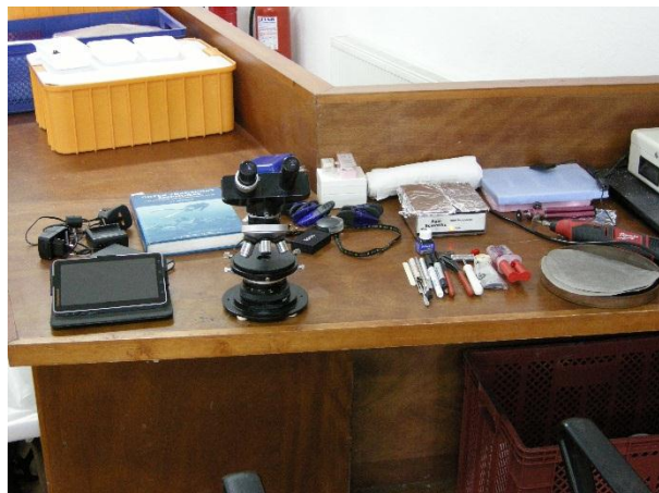
Figure 15: Portable thin-section laboratory in the Nautical Museum in Bodrum, Turkey, 2010. Seen (right to left) are the rotary tool with a diamond disk saw/lap wheel, two polishing pads in a platter, a double syringe of “5-minute epoxy,” mini hotplate, an early version of the Goren portable microscope, a reference book on Greek transport amphorae, and a Tablet

this side of the glass is ground matt to ensure better holding of the sample. When modern epoxy glues replaced the traditional Canada balsam or Lakeside cements, however, we found that it was possible to glue the samples directly onto the unprepared glass. The glass must be free of any dust, oil, or fingerprints that may hamper proper bonding.