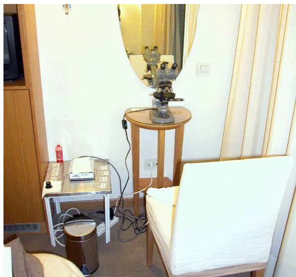
Figure 6: Portable thin-section laboratory in a hotel room in Greece, 2005. The Olympus K Model microscope stands on the small table. To the left are a hotplate, epoxy double syringe, and samples. The cutting and grinding equipment was used in the bathroom (not seen in the photo)

With respect to micromorphology, thin sections are normally prepared and examined in the excavation camp after the day's fieldwork or a hotel room after the day's sampling activity (Figure 6). Although some excavation headquarters may still be tent camps with limited running water and no electricity, in most cases—including the Middle East—these romantic days are long gone. Nowadays, expedition directors frequently rent a guesthouse, school facility, or cultural center to host their staff for the season. If conditions allow, they may even stay in a local hotel. All these forms of accommodation allow the preparation of thin sections with the same basic equipment kit.