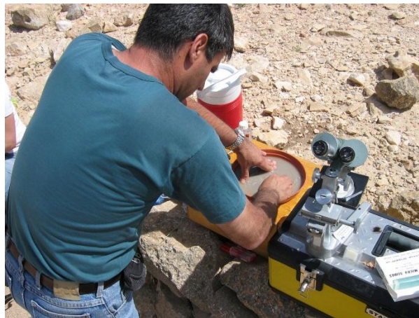
Figure 14: Grinding pottery samples for thin-section analysis in field conditions during the excavations at Oboda (Avedat), a Roman and Byzantine city in the Negev, Israel. The sample is ground on a metallographic diamond polishing pad immersed in a shallow platter

P220 or 58.5 \mu ) or 320 grit/P320/40.5 \mu for coarse flattening of samples, 400 grit/P800/21.8 \mu for finishing, and, if desired, 600 grit/P1200/15.3 \mu for super-thin sections (below 30 \mu )—for clay sediments, for example.