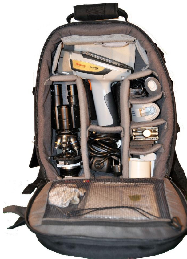
Figure 5: My backpack for flights to overseas field projects. At the top is the portable XRF, whose accessories are spread over the other compartments. The MRC® Goren portable microscope (petrographic version) is seen on the left side of the pack. The front compartment (open in the photo) contains a laptop and personal items (wallet, passport, etc.). Other equipment is packed in the checked-in suitcase (Figure 9)

With respect to micromorphology, thin sections are normally prepared and examined in the excavation camp after the day's fieldwork or a hotel room after the day's sampling activity (Figure 6). Although some excavation headquarters may still be tent camps with limited running water and no electricity, in most cases—including the Middle East—these romantic days are long gone. Nowadays, expedition directors frequently rent a guesthouse, school facility, or cultural center to host their staff for the season. If conditions allow, they may even stay in a local hotel. All these forms of accommodation allow the preparation of thin sections with the same basic equipment kit.