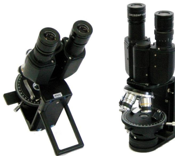
Figure 17: The commercial version of the Goren portable petrographic microscope, now available from MRC Ltd. Laboratory Equipment. The microscope offers laboratory-level optical quality, ergonomics, and performance but with self-sustained power in small, portable dimensions. A biological version with X-Y mechanical stage, 100X oil objective, and optional phase-contrast is also available in this format

Packed in a backpack together with the portable XRF instrument ( Figure 5 ), the thin-section preparation laboratory kit going in a suitcase, the microscope can be used in virtually every location and facility for on-site study of objects, site sediments, or any subject requiring scientific investigation that does not allow the use of a permanent research laboratory. This freedom opens up new horizons of scientific investigation across every aspect of research in science and industry.