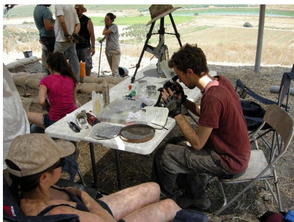
Figure 7: Operation of a portable micromorphological laboratory at the author's excavations at Tel Sochoh, Israel, 2012. The laboratory includes equipment for thin-section preparation, a prototype of the Goren portable petrographic microscope, and a portable XRF (on the tripod below the hat)

mineral crystals as seen by the human eye being neither too high nor too low by spectral order. Although the idea of slicing and grinding a rock so thinly may appear a complicated operation, it is in fact quite simple, the students in our Laboratory for Comparative Microarchaeology at Tel Aviv University regularly mastering it after a few weeks of training.