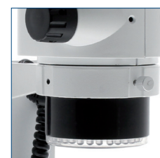
● Built-in LED ring light SB.3903

A spare fuse, Ø 60 mm transparent and black/ white stage plates are not applicable for -U models