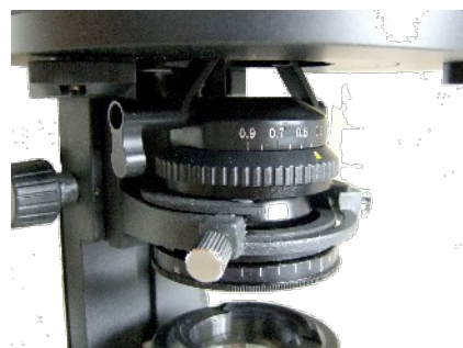
NA 0.9 condenser with flip-in lens and integral rotating polariser