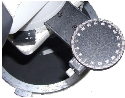
Push-in analyser (360° rotating) and 1st order red tint