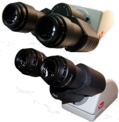
Binocular tubes fully moveable for 'up' or 'down' viewing position

Complete with custom fit aluminium carry case