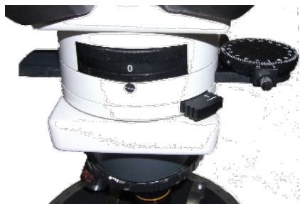
Analyser, 1st order red tint plate and bertrand lens