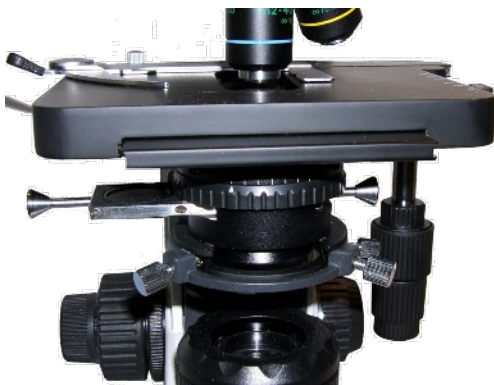
Condenser NA 0.9 with phase slider inserted.