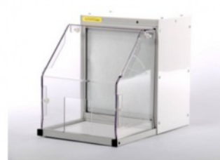
Aerosol Sampling Enclosure [AS300]