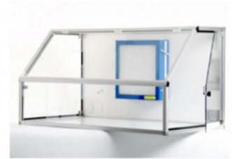
Large Sample Preparation Enclosure [SA1000]