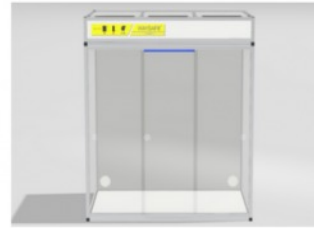
Evaporator Enclosure [EV700-1300]