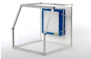
General Purpose Enclosure [GP540]