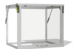
Electrical Testing Safety Enclosure [SE600]