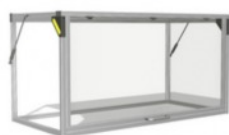
Electrical Testing Safety Enclosure [SE1000]