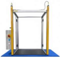
Light Curtain Safety Enclosure [LC700-1600]