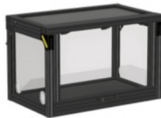
Insulated Safety Enclosure [SE800i]