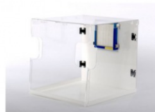
Balance Hood Enclosure [BH550]