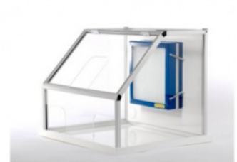
Sample Analysis Enclosure [SA640]